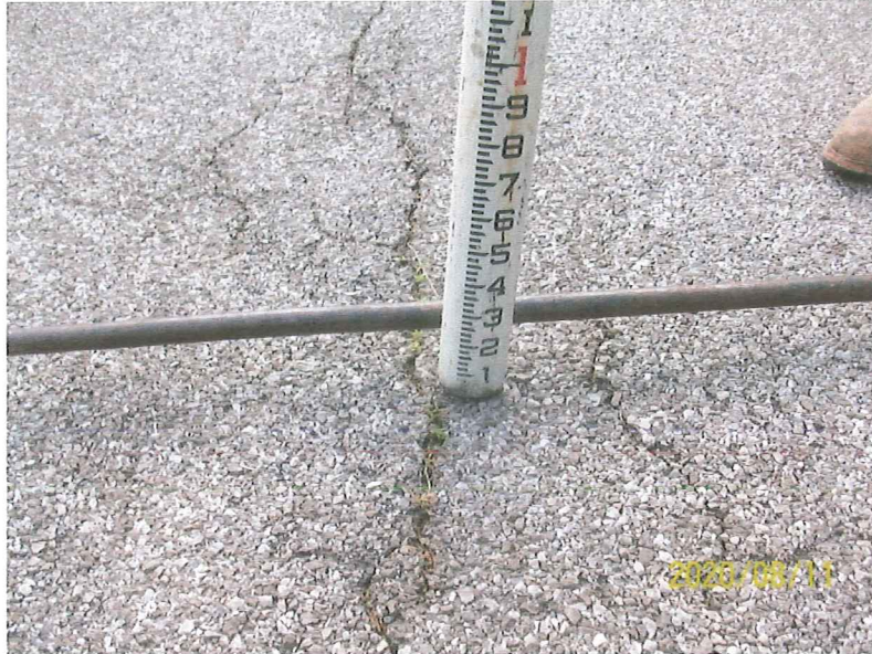
TR-218 rutting east bound lane