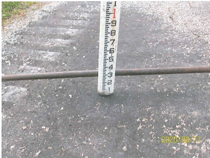
TR-218 rutting west bound lane