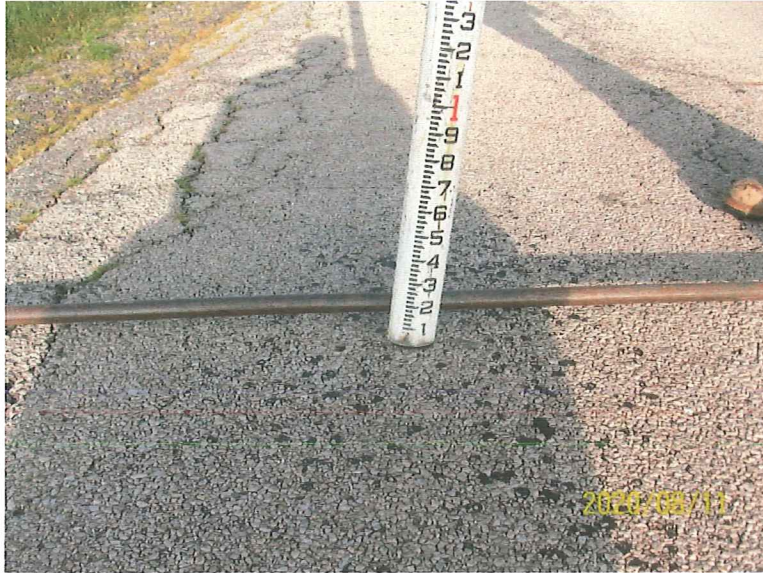
TR-72 rutting west bound lane