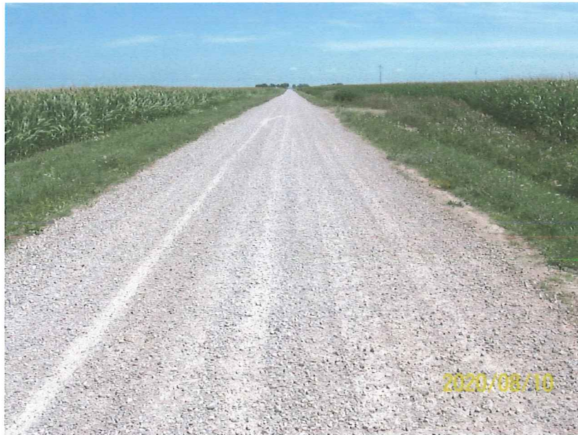
TR-60 from SR-49 to TR-47 looking east