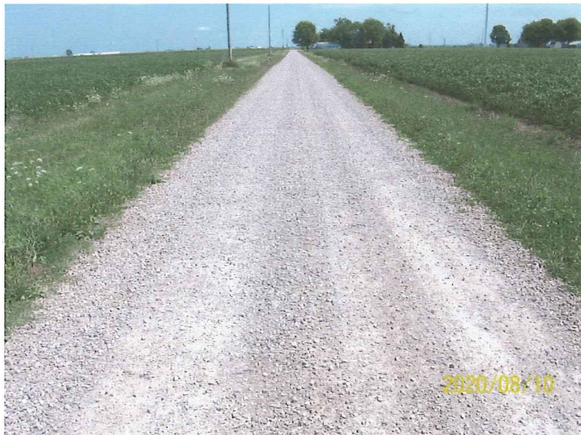
TR-60 from TR-49 to CR-55 looking east