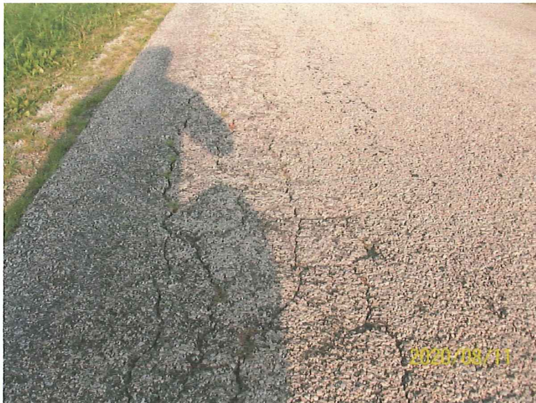
TR-72 longitudinal cracking west bound lane