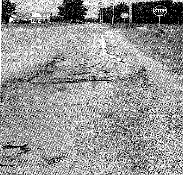
Looking west on Buckskin Rd. The pavement has chunks of road missing.