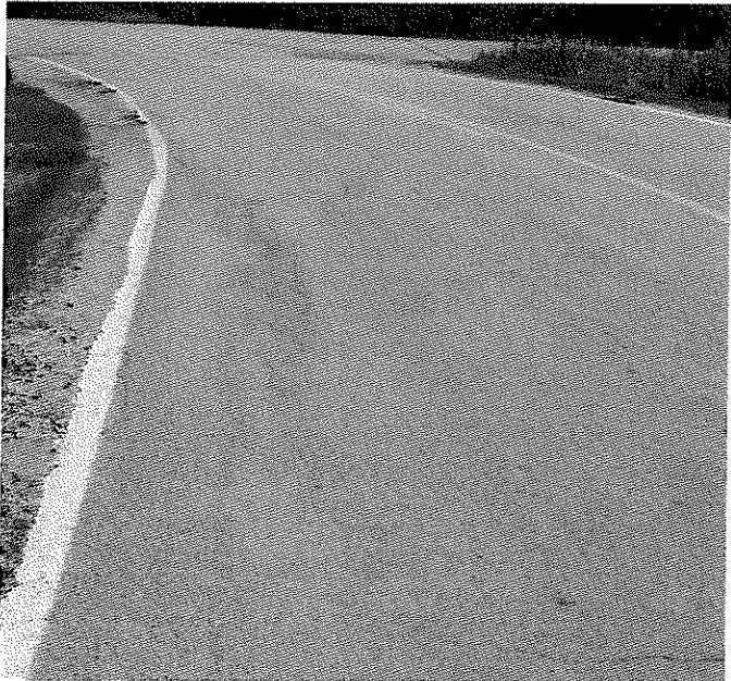
Looking east on Powers Road. The roadway has a dip and wheel rutting.