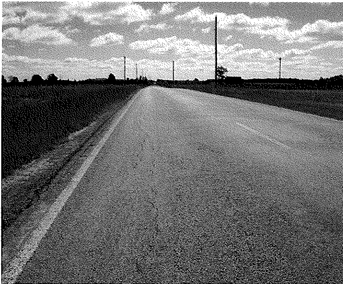
Looking east on Buckskin Rd. The pavement has wheel rutting.