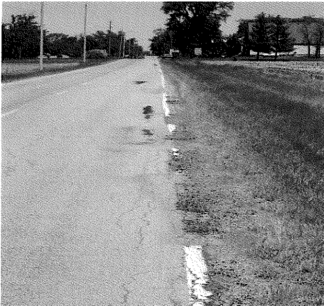
Looking south on Farmer Mark Road. The pavement has patches and the edge is missing.