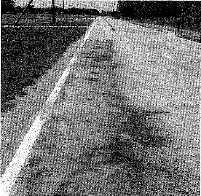
Looking west on Powers Road. The pavement has chunks missing and some patching.