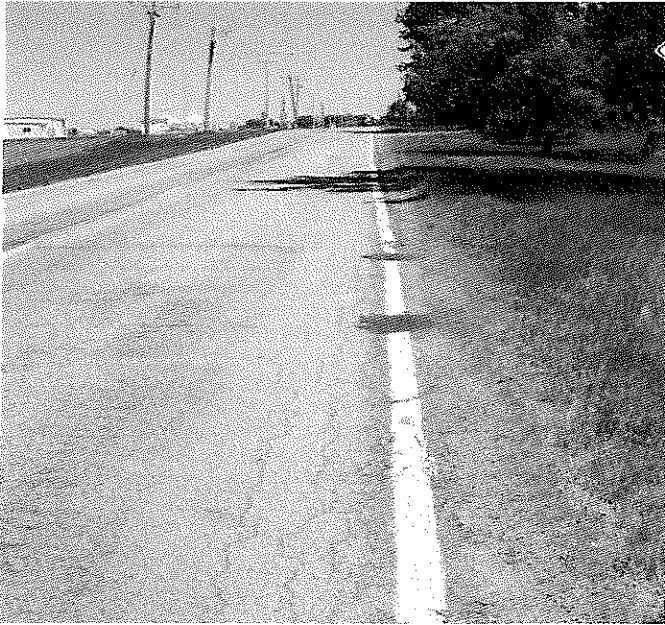
Looking north on Farmer Mark Rd. The pavement has wheel rutting and the edge is cracked.