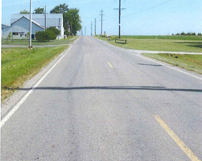
Looking North on Hicksville Edgerton Rd. There is wheel rutting.