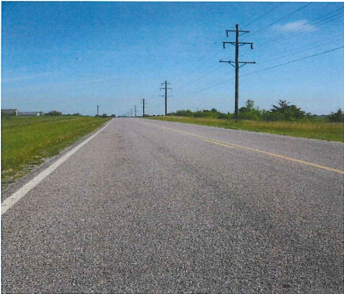
Looking North on Hicksville Edgerton rd There is wheel rutting across the road.