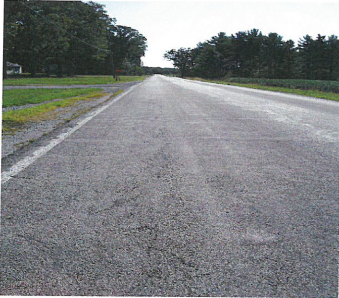
Looking East on Buckskin Rd. On the North side of the road there is wheel rutting.