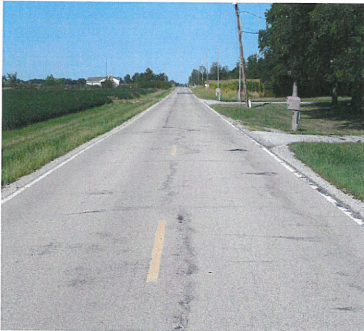
Looking West on Buckskin Rd. There is some rutting and pavement cracking.