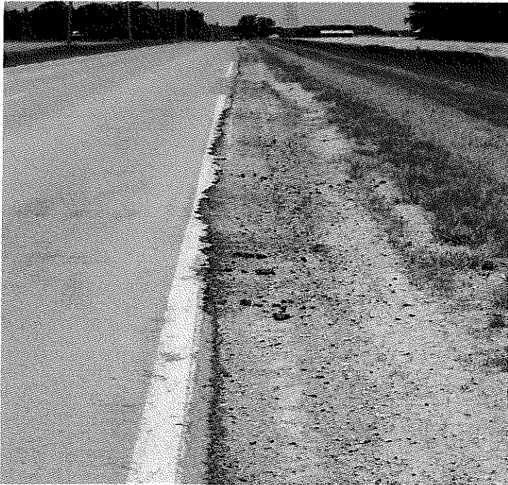
Looking north on Harris Road. The edge of pavement is cracking and chipped.