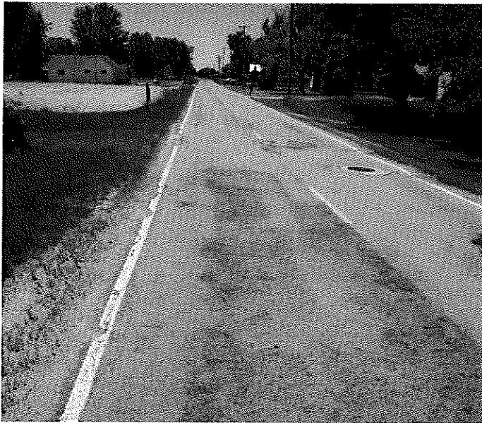
Looking east on Blanchard Rd. The pavement has wheel rutting on both sides of the road.