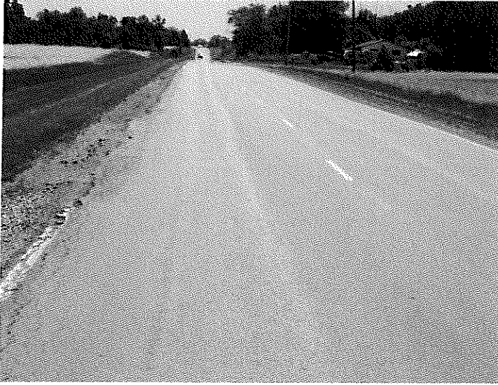
Looking south on Harris Rd. There is wheel rutting on east bound lane.