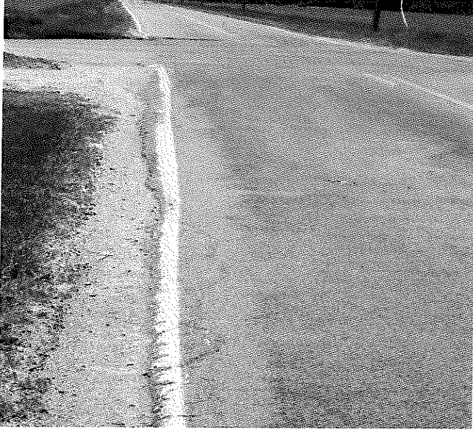
Looking west on Blanchard Rd. The edge of pavement is cracking and chipped.