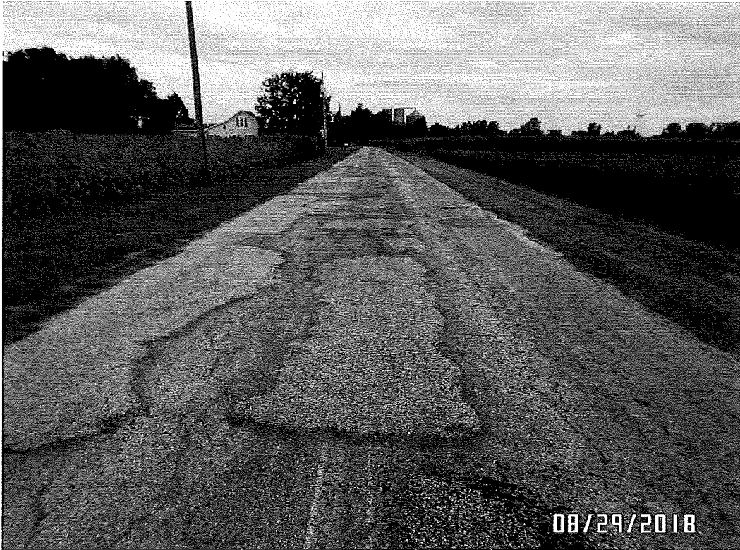
Road 6-3 (F to Delta)