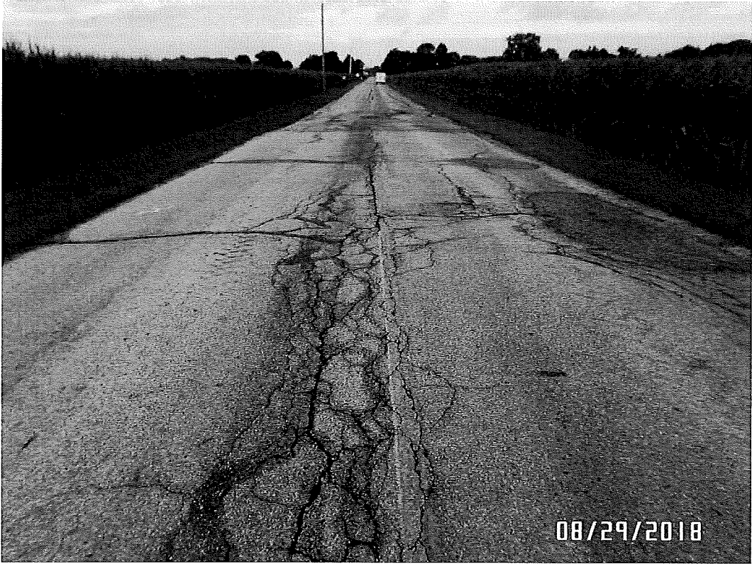
Road F (5 to 5-2)