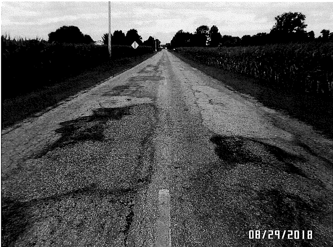
Road F (5 to 5-2)