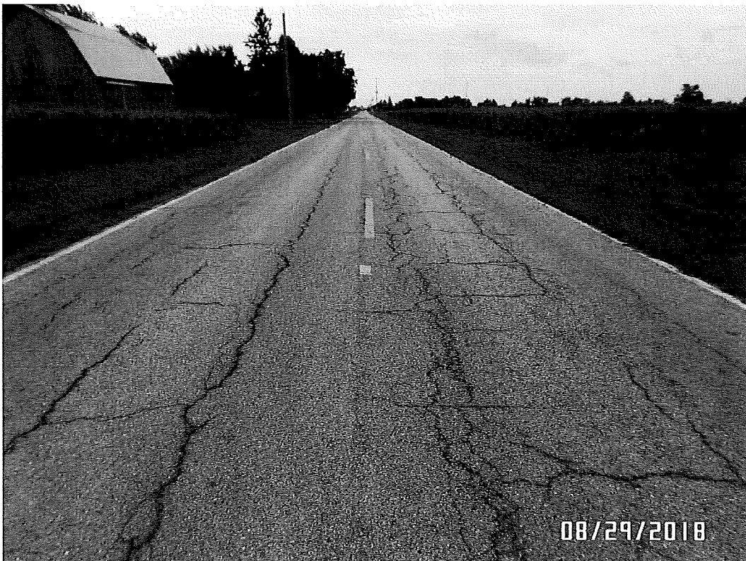
Road 5-2 (US20A to H)