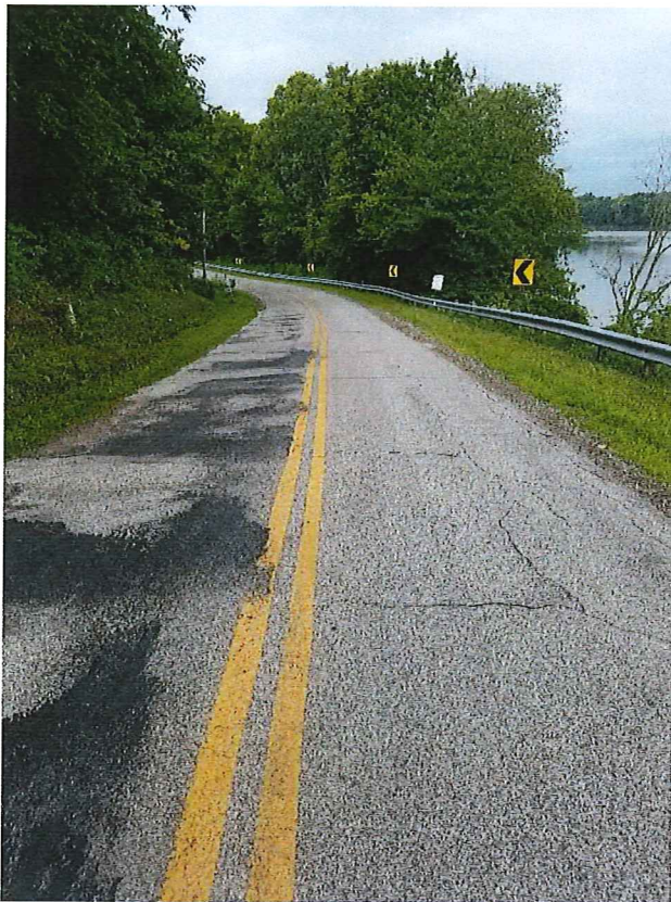
Areas of cracking and various patches