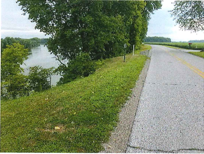
Hazard markers at locations where bank erosion is encroaching roadway. Moving road away from banks of Maumee River.